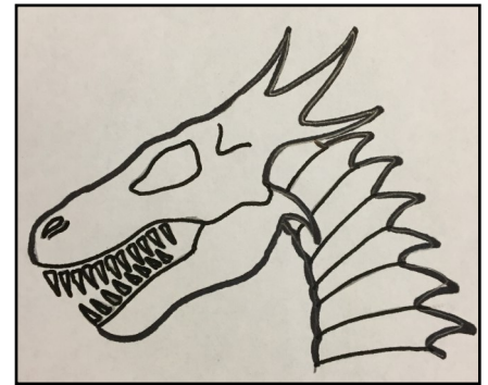
A Common Flintmaster

They have rarely been observed in their complete forms and sleep for long periods, usually close to treasure. Experts think many are now hiding in museums pretending to be dinosaur bones!