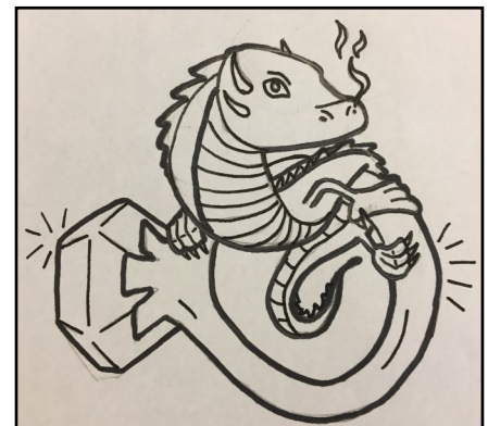
A Copperback claims it's jewellery.

They are extremely territorial and are often seen biting each other whilst fighting over sparkly things. Even larger dragons have been known to abandon their treasure if Copperbacks invade because they are very loud when